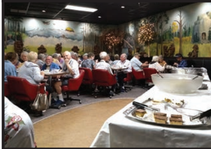
A wonderful tour and lunch