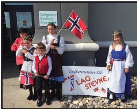
A really cute welcome committee