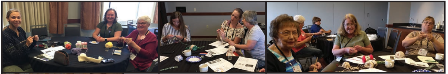
Knitting, knitting, knitting