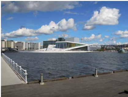
The beautiful Oslo Opera House in Oslo Harbor

Ideally, the letter should also commit to sharing, by a date certain, the information or insight gained, via an article prepared for the Saga or the web site, by a presentation at a stevne, or other means.