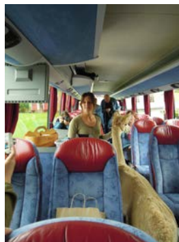
An occasional surprise. Åke, the alpaca, on our bus!