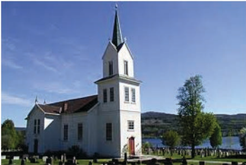
Olberg Church with Lake Krøderen in the background

Note: Dear Readers, Our 2012 Sigdalslag Tour of Norway included visits to several churches in Sigdal and Krødsherad Kommunes. There is such fascinating history and beauty associated with these churches that I decided to write a brief synopsis of each of them for those of you who could not be there in person.