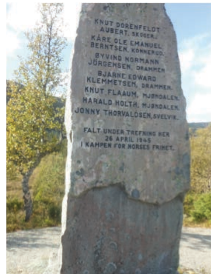
Haglebu Memorial Monument inscribed with names of Norwegian soldiers who died in the last battle of World War II. A metal plaque on the front is engraved with gratitude to the fallen comrades.