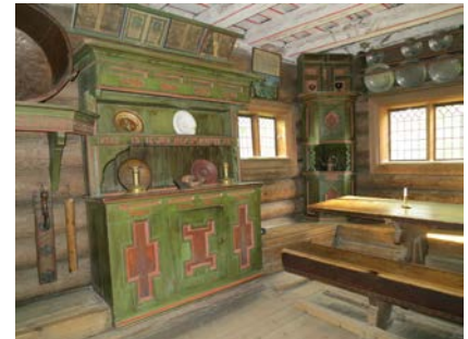
One of the many, finely detailed homes on display at the Norsk Folkemuseum in Oslo