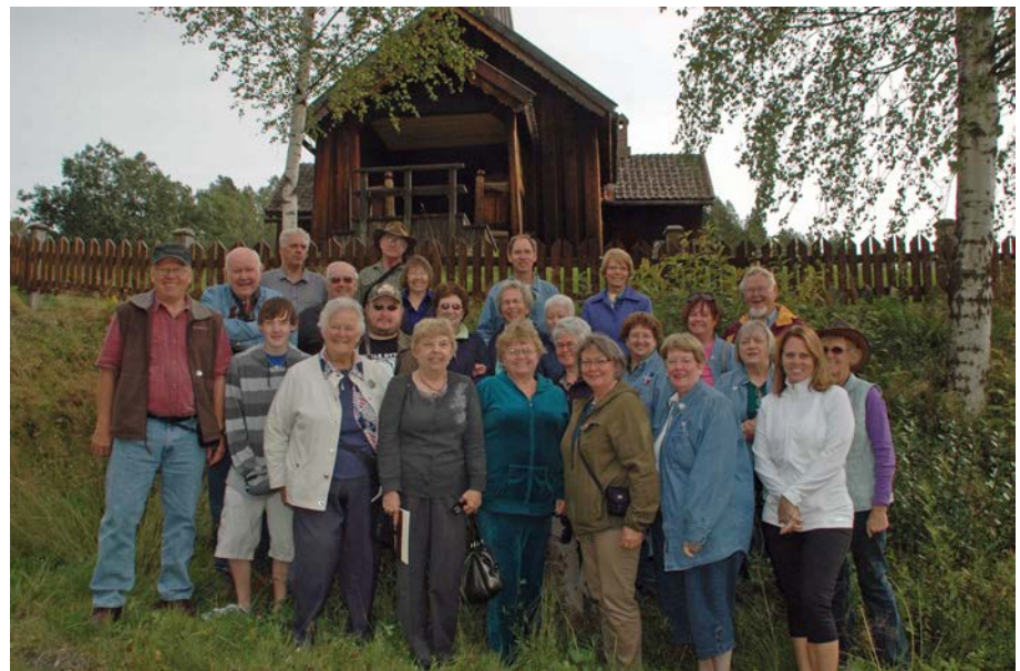
The 2012 Sigdalslag Tour Group