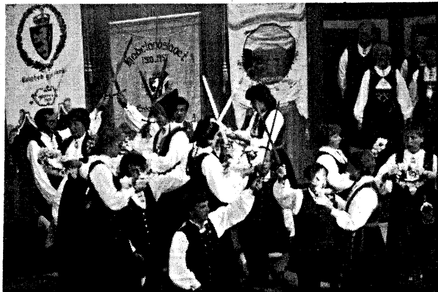
SOGN OG FORDANE-RINGEN FOLK DANCE GROUP